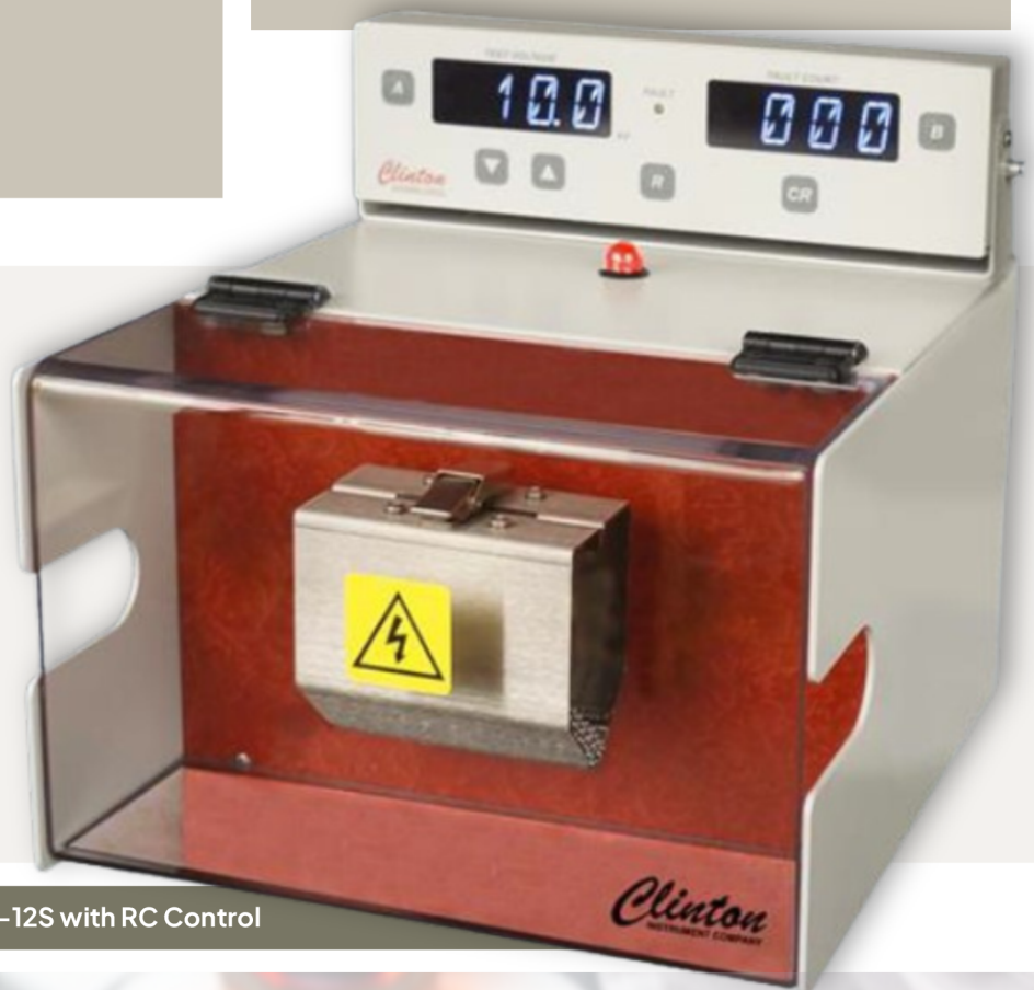
HF-15B/BD-12S with RC Control