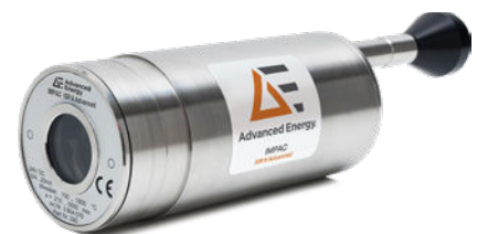
Impac ISR 6 Advanced

The pyrometer measures the very bottom tip of the blind tube, which reaches thermal equilibrium with the environment inside the furnace.