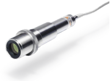
Mikron PhotriX series

The Advanced Energy pyrometer is optimized to measure as close as possible to the seed layer.